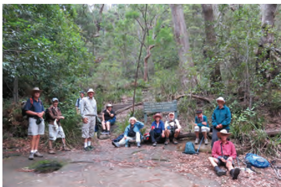
Fairy Bower Walk