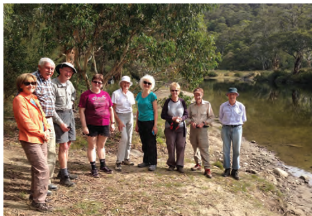
The Snowy River at Island Bend