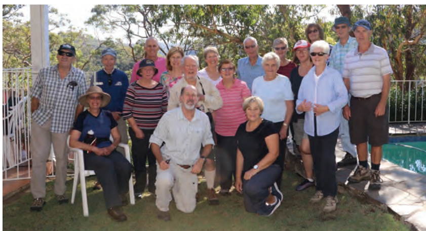
Morning Tea on the Castle Cove Walk

We look forward to seeing you on a walk soon.