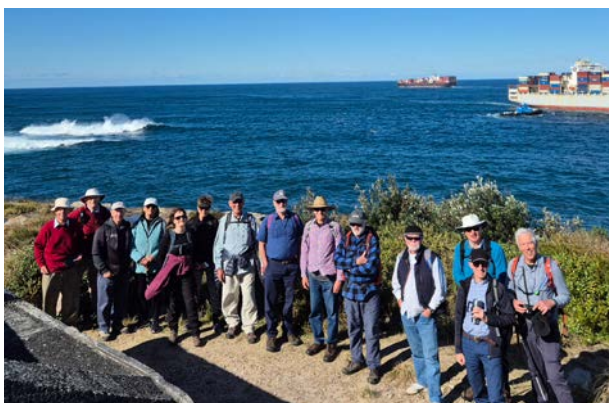
La Perouse Walk

We look forward to seeing you on a walk.