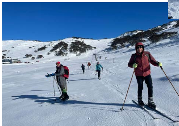
Summit Tour-Heading for Perisher