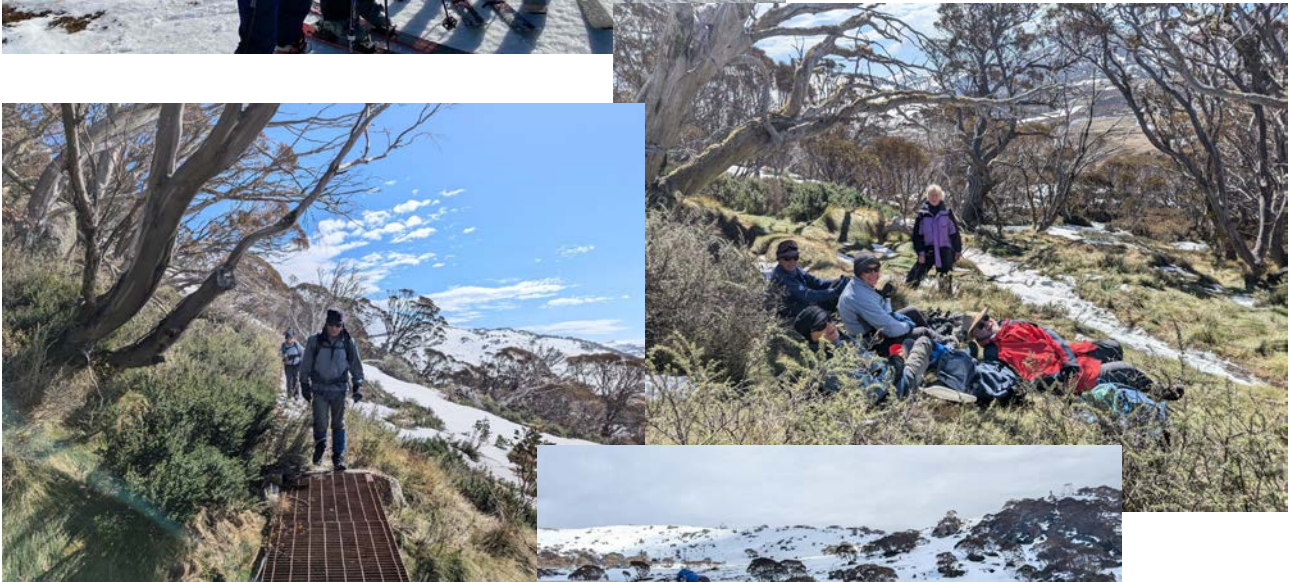
Nordic Week collage