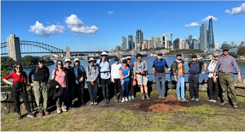
Sydney Harbour Walk