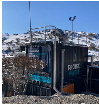
Following a fire at the Charlotte Pass resort sewerage treatment plant, containerised modules were installed.

The best news for the Lodge Co-operative was that Charlotte Pass Lodge finally obtained its Occupation