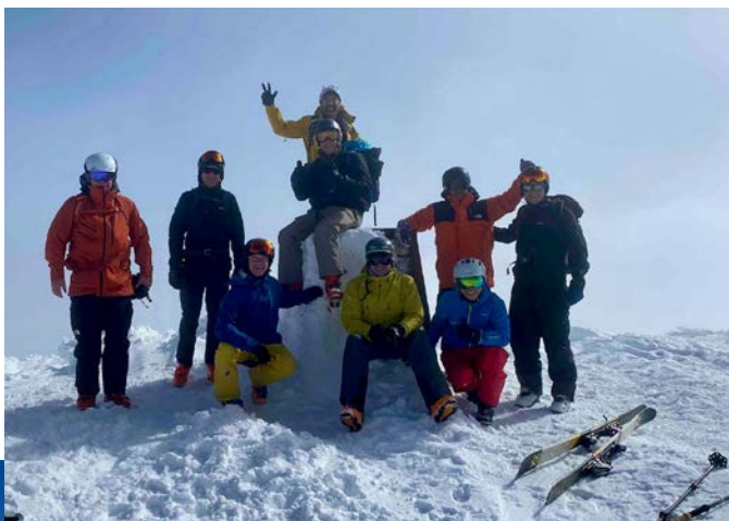
Summit Tour-Kosciuszko Trig