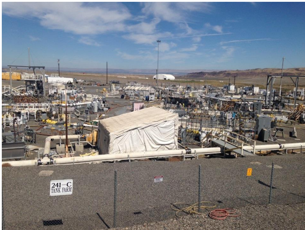
Figure 1: Tank Farm 241-C