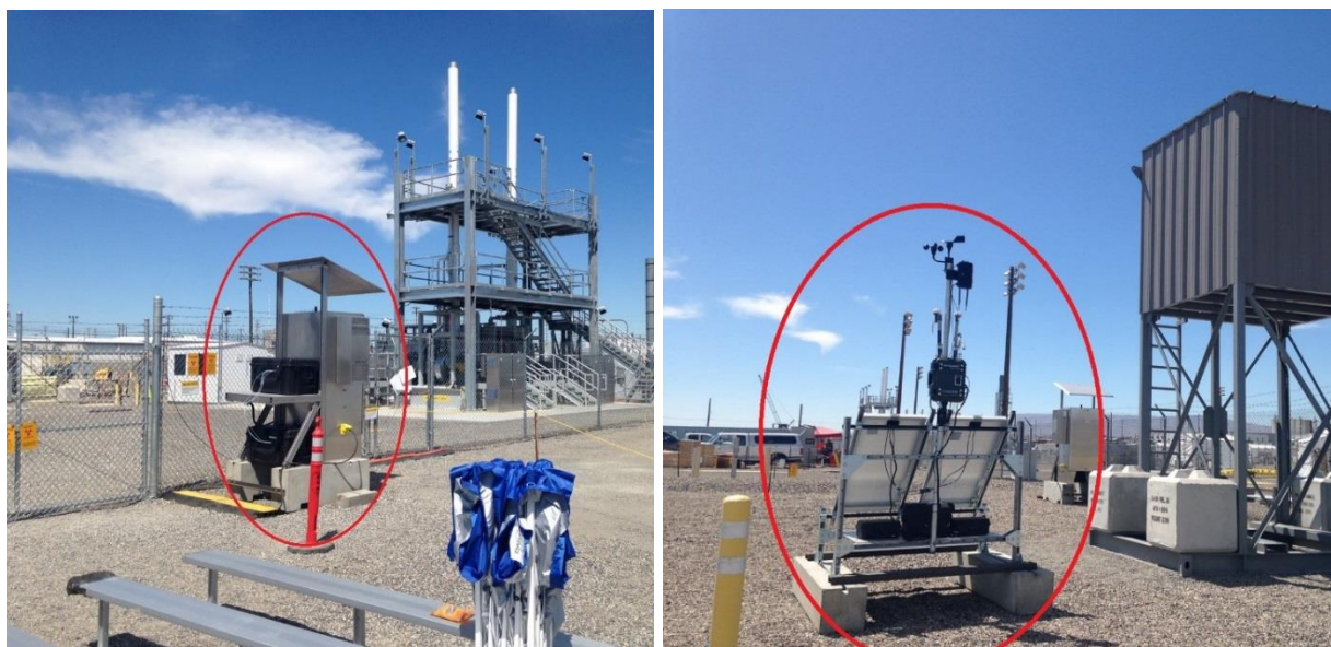
Figure 2a and b. Air Samplers and Monitoring Equipment on the Periphery of the Tank Farm

In addition to these fixed sampling technologies, WRPS and DOE representatives indicated that worker exposure data will be collected through the use of personal Summa whole-air sampling canisters and Cub IonScience PIDs. These newly acquired technologies are intended to provide real-time and continuous data on selected COPCs in an integrated system with wireless communication. The Summa whole-air canisters are intended for real-time collection of a personal air sample during an odor event for subsequent laboratory analysis via GC/MS. The Cub IonScience PIDs detect volatile organic compounds (VOCs) and other compounds as a class but are not specific to any one single contaminant that may be present.