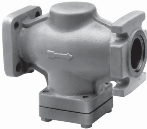
2" Strainer: ST200