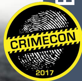
EXHIBIT HALL SPONSORS