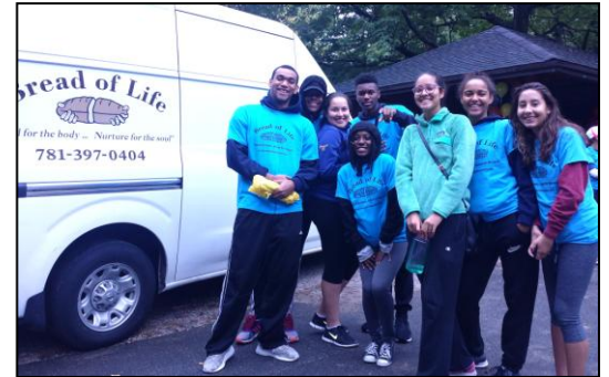
High School athletes participating in the 2016 Walk for Bread & 5K Run.