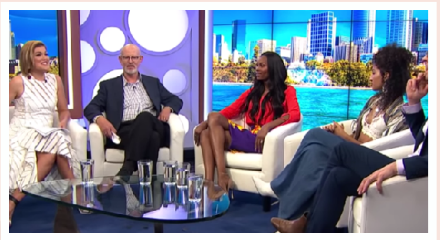
Now This News - Dominique on Expanding Trans Representation

Studio 10 - Talking 'Pose' and Ballroom Culture