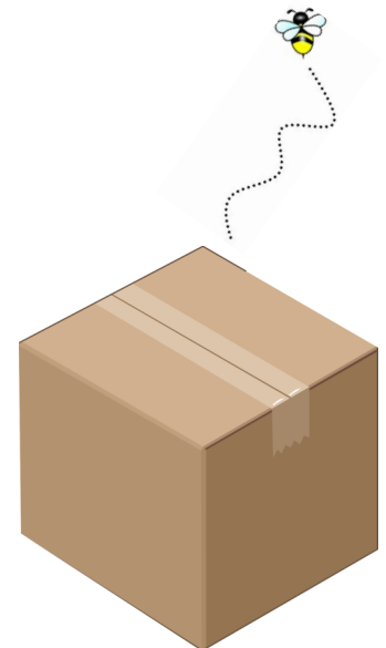
A simple emergence chamber.

The Edmonton and Area Land Trust works to protect natural areas, to benefit wildlife and people, biodiversity and all nature's values, for everyone forever. We steward these special places with volunteers and neighbours, who are critical to our work, and we educate the public to protect nature for future generations.