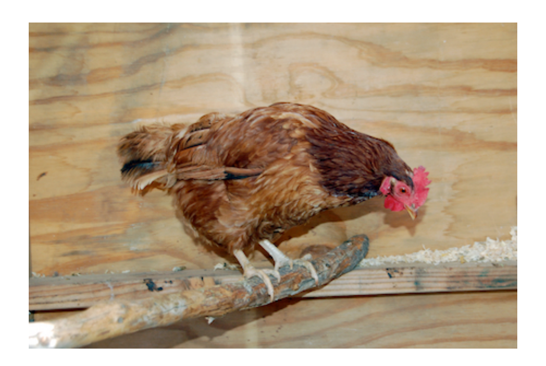
There are nests in the shed.