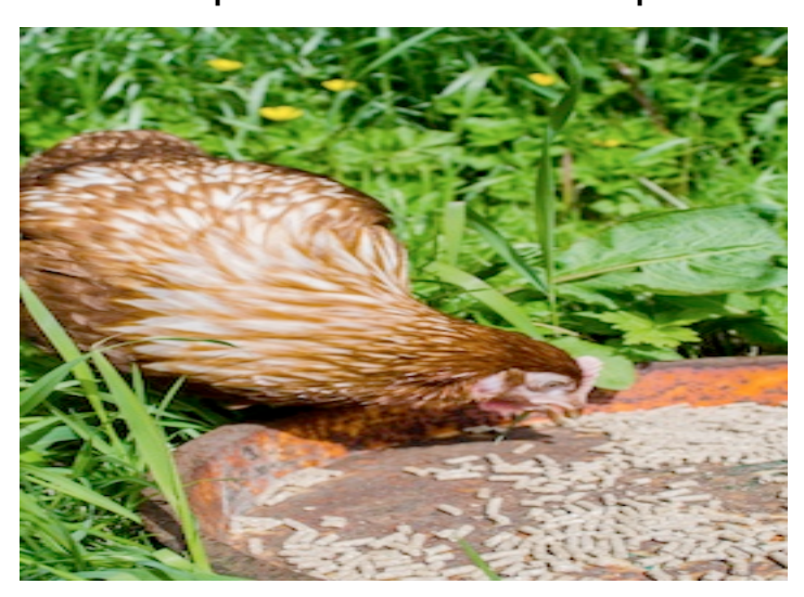
The hens scratch in the dirt.

In the pen the hens pecks at their food.