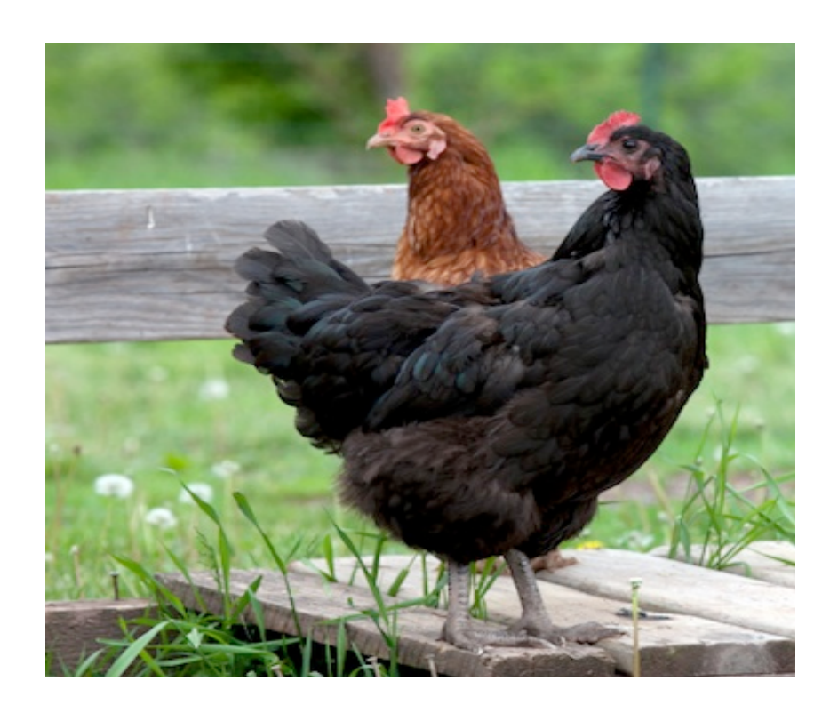
Freckles likes to run.