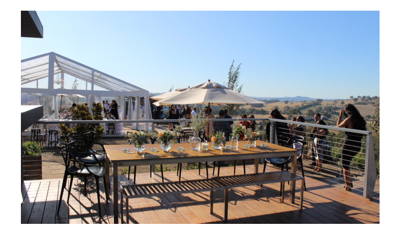
Only limited by your imagination -make your event unique and special. A venue to take on your dream wedding.