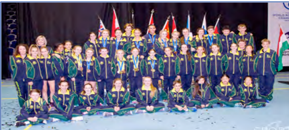
The triumphant Team Australia who recently competed at the recent 2016 World Championships in Malmo, Sweden.