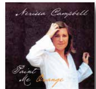
Paint Me Orange 2003