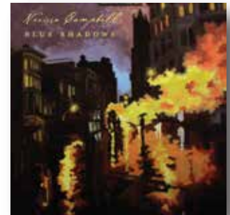
blue shadows 2012