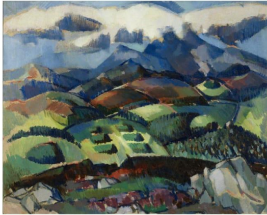
Looking over Killiecrankie. JD Fergusson