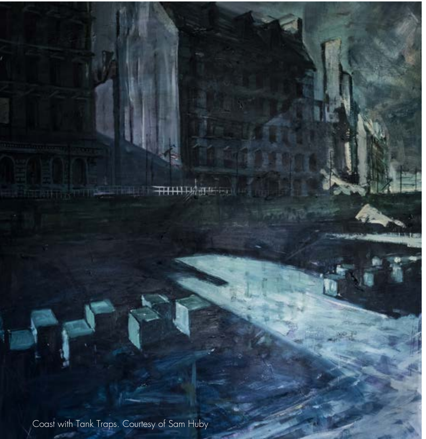
Coast with Tank Traps. Courtesy of Sam Huby