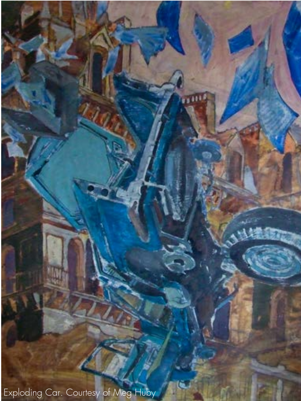
Exploding Car.