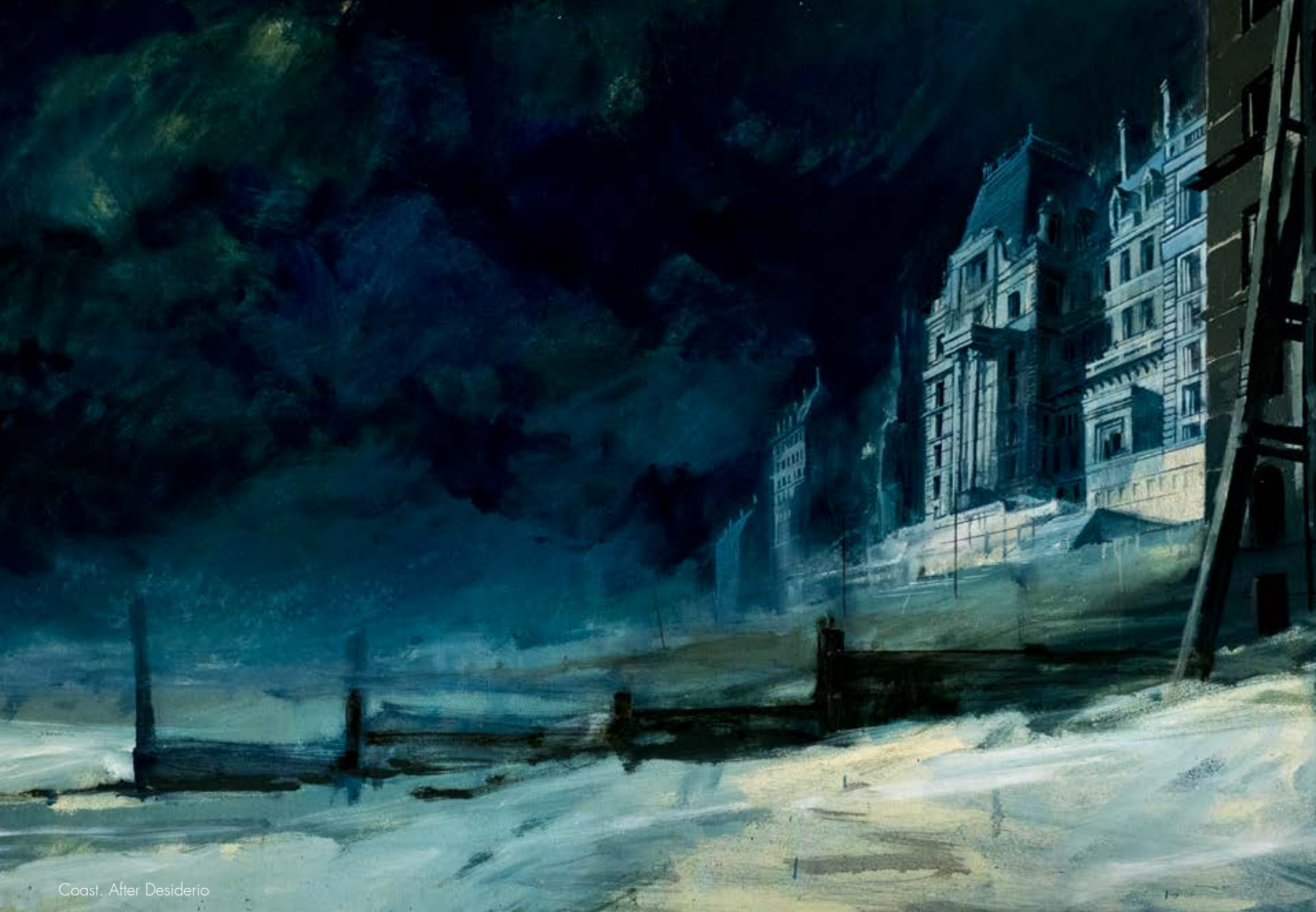
Coast. After Desiderio