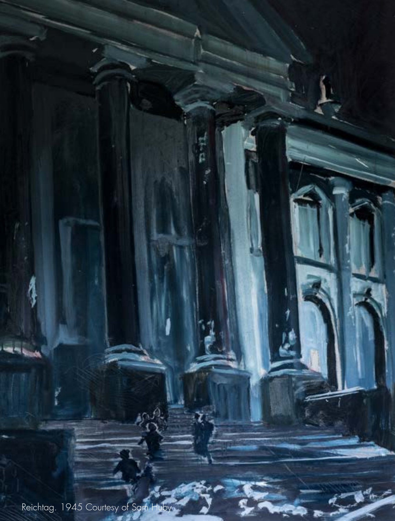
Reichtag. 1945