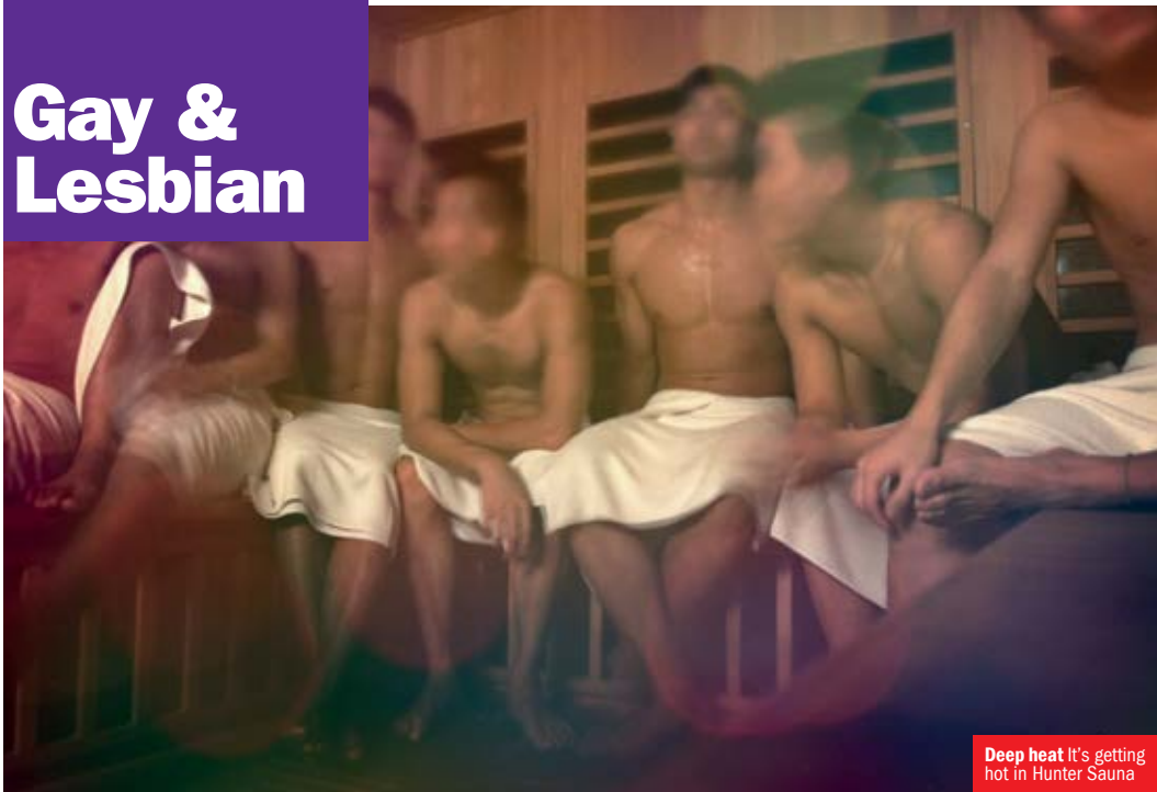
Deep heat It's getting hot in Hunter Sauna