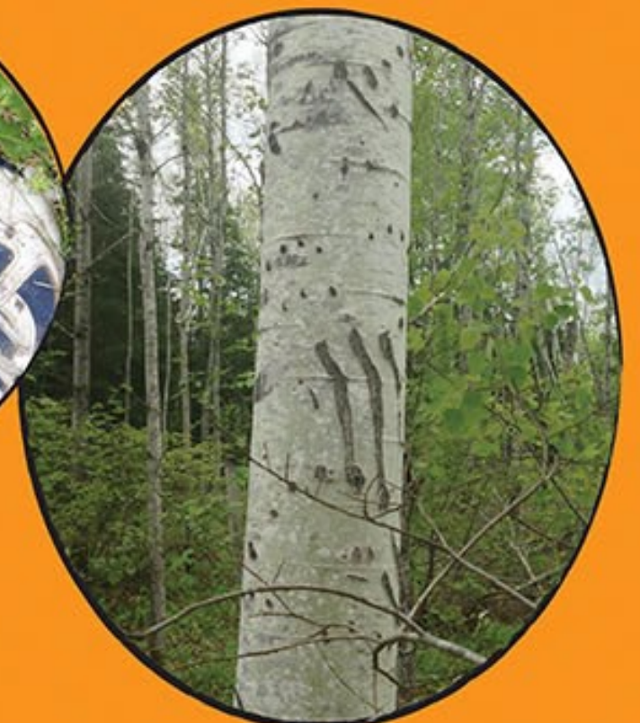
Markings on trees