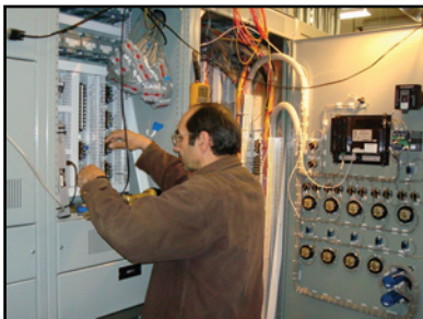
New primary switchgear