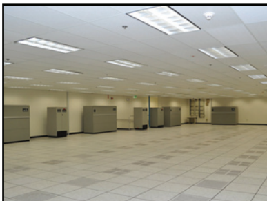
New data center finishes