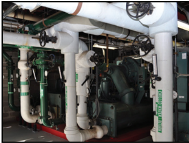
New digital chiller controls