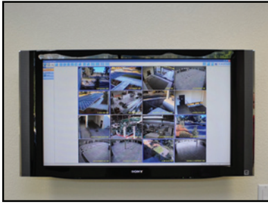
New Digital Camera Installation