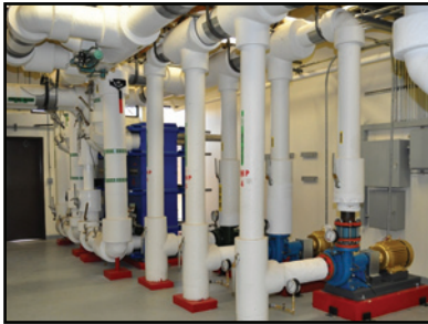
New building automation system and controls