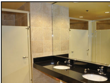
New common area finishes