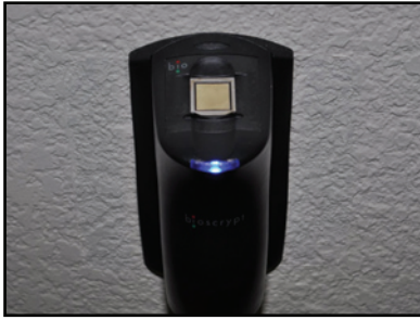
New biometric entrance controls