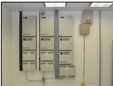
New card access system