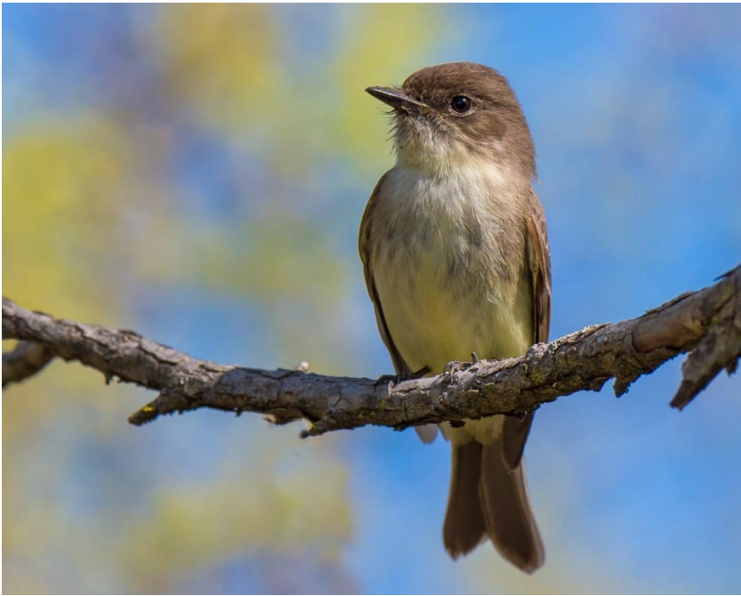
Nothing but Blue Skys by Mike Sweatt. 12 pts.