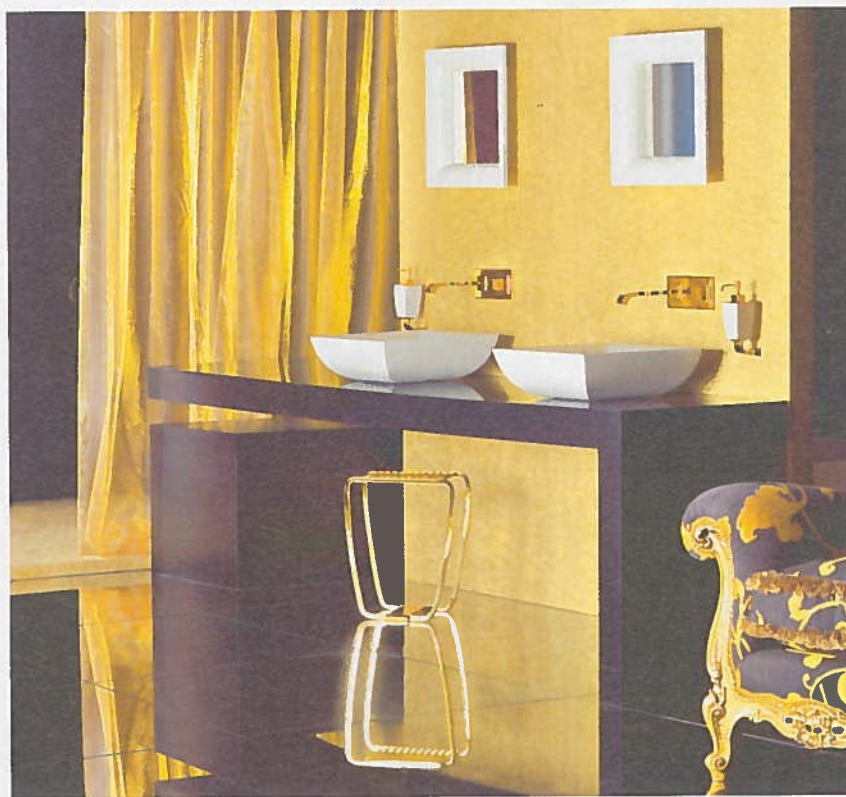
Get glamorous: clockwise from top, Fired Earth's Aphrodite Cyprus basin; Crystal Bateau bath by Catchpole & Rye; CP Hart's Mimi collection by Gessi

hints of glass, shiny fabrics, glossy black lacquer and motifs all qualifying.