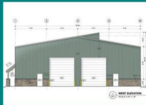
Actual Building to be Built