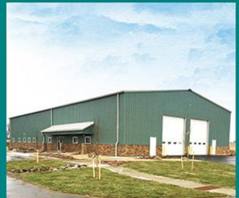
Actual Building to be Built