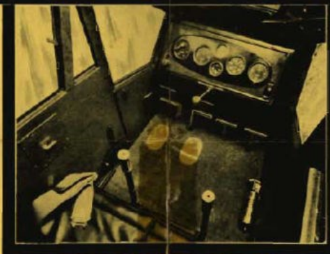
Interior of CARDINAL cabin showing instruments, dual controls, seat cushions and miscellaneous equipment.

110 miles per hour with ample reserve for a top speed of 125 and will climb from 1000 to 1200 feet the first minute. The installation of brakes designed and built in our own plant assures positive control on the ground under all circumstances. The performance of the CARDINAL is outstanding and satisfying.