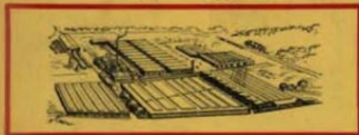
WHERE THE CARDINAL IS BUILT

THE St. Louis Car Company, parent organization of the St. Louis Aircraft Corporation, are pioneers in the development and manufacture of transportation equipment. It was organized in 1887, its first product being horse-drawn street railway cars. The company is now one of the largest builders of steam railroad and electric railway equipment in the United States. Its sixty-acre plant is located in North St. Louis. This successful organization is behind the CARDINAL .