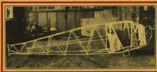
Skeleton of fuselage.

CARDINAL Control Surfaces. The tail group and ailerons are of welded 1025 carbon steel tubing. The stabilizer is adjustable from 1° positive to 4° negative, making it possible to adjust for fore and aft balance and to fly hands off at all engine speeds. The ailerons are suspended at the hinge thru three duraluminum bearings and braces.