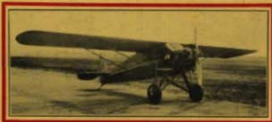
Cardinal with Le Blond 85