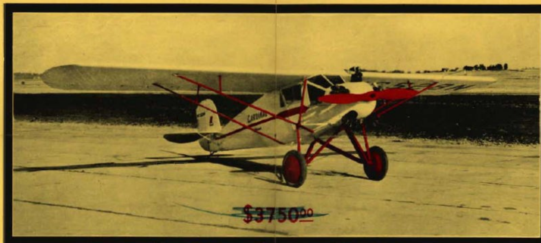
The CARDINAL , powered with a Kinner Motor.

The Clark Y wing section assures excellent lift and high velocity but with safe lateral control at stalling speeds. The CARDINAL is so carefully balanced that it will cruise indefinitely or fly in a forty-five degree bank without using either the stick or the rudder, and is infinitely more comfortable for long cross country flights because of this and its inherent stability. It must be forced into a spin and will come out of it in less than \frac{3}{4} of a turn with the controls released. It is extremely maneuverable and light on the controls and will do slow or snap rolls, Immelmans, and will maintain itself in continued inverted flight. The CARDINAL , powered with a Kinner Motor will cruise with ease at from 105 to