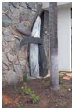
One of the two Whales