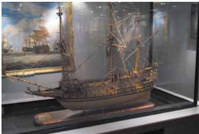
Sovereign of the Seas British, 100 guns By Ed Marple