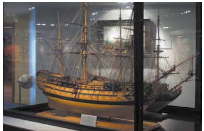
Royal George British, 100 guns