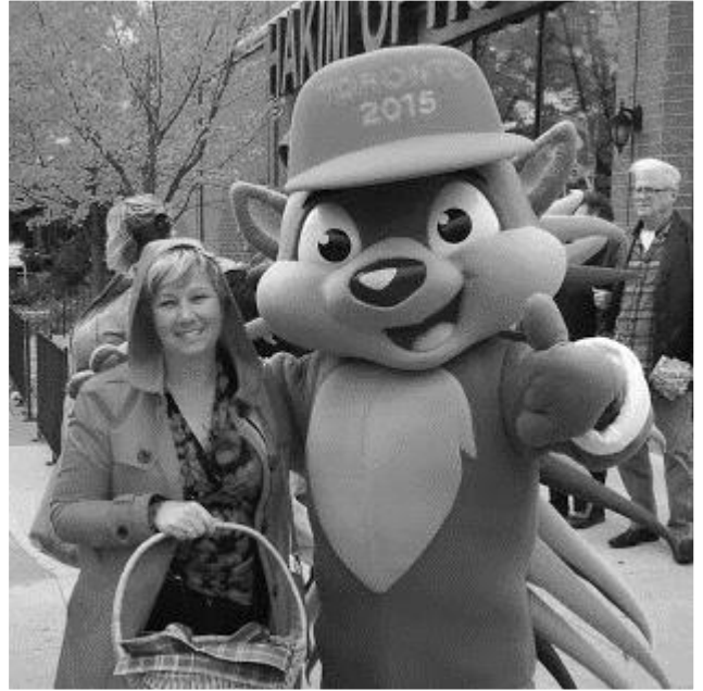
Patchi, the 2015 Games mascot, visiting our ward.

For more information on the games, maps of event locations, and how our ward can prepare, please visit my website or www.toronto2015.org .