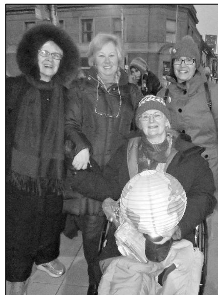
With residents at the Green 13 Earth Hour Walk

100 Queen Street West Suite C46 Toronto, ON, M5H 2N2