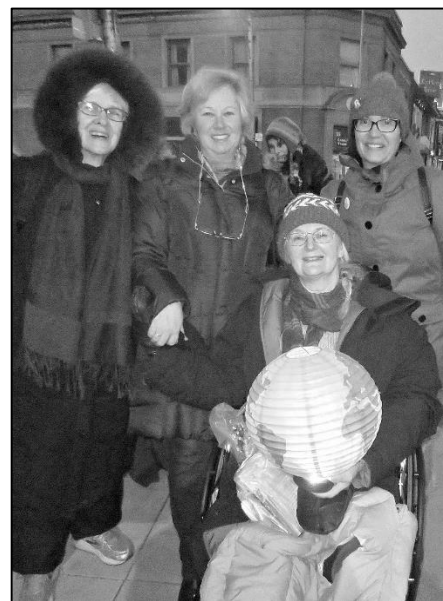
With residents at the Green 13 Earth Hour Walk

100 Queen Street West Suite C46 Toronto, ON, M5H 2N2