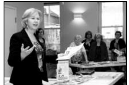
Speaking to residents at the Seniors Town Hall