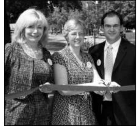
Cutting the ribbon for the Baby Point Gates BIA renewal project