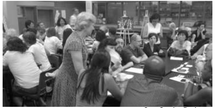
Core Service Review

The Parks department will be undertaking the removal and replacement of the stairs at Ormskirk Park. Construction for this project is scheduled to be completed by the end of 2011 and I will keep you posted as the project progresses.