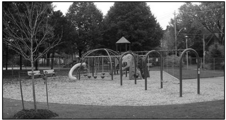
Vine Parkette's new play area

As some of you may be aware the corner of the laneway just south of Dundas St West on Mavity St had experienced a recurring problem over the years with the illegal dumping of garbage. However, with community collaboration, the help of the building owner, and increased monitoring by the City's Municipal Licensing and Standards department, this location has greatly improved. Thank you to everyone for a successful collaboration!