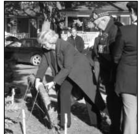
Swansea Legion's Remembrance Day Service