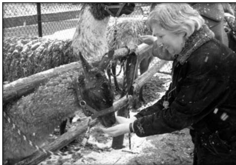
Visiting with the llamas at the High Park Zoo

The Friends of High Park Zoo are using the suggestions gathered at the meeting to put together a business plan to find sustainable funding of $227,000 per year to keep the High Park Zoo open. I would like to thank everyone who has donated their time and money to help us continue to keep this free, year-round, family destination open. (Cheques can also be used and mailed to Toronto Parks and Trees Foundation, 157 Adelaide Street West, Suite 123, Toronto ON M5H 4E7. Please clearly write "High Park Zoo" in the subject line.)