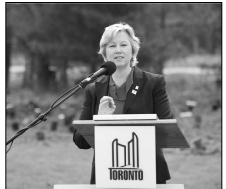
Speaking at the Trees Across Toronto launch.