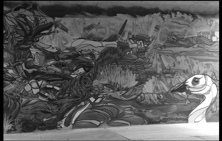
8. 7 th Generation Mural

The evening ended on a positive note when one officer announced that 22 Division had made a significant arrest. As a result of this arrest valuables from numerous break-ins were recovered and people who were victims of these break-ins were invited to view the items recovered.