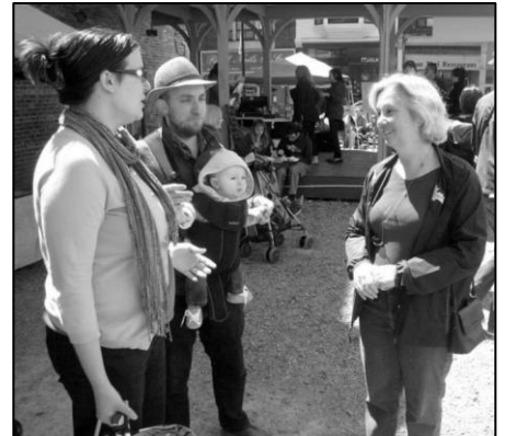
Meeting with residents at the Junction Farmer's Market.

www.ward13.ca councillor_doucette@toronto.ca 416-392-4072 100 Queen St W, Ste C46 Toronto, ON, M5H 2N2