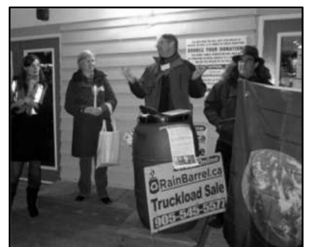
With residents at the High Park Earth Hour Walk