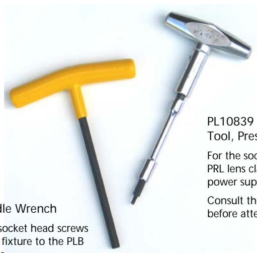
PL10860 Tool, T-handle Wrench For the three socket head screws fixing the PRL fixture to the PLB mounting base.

Point Lighting Corporation recommends return for factory repair and refurbishment of LED PRL lights. In the event of field service, the PL10839 preset torque wrench kit use with the instruction manual is recommended to assure proper resealing of the fixture.