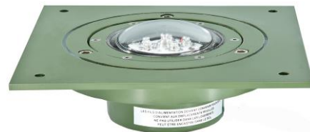
PRL-97004-2H-G-SR FOR OFFSHORE METAL HELIDECKS

The fixture shall be treated for marine conditions by cleaning per US Department of Defense TT-C-490 method III, pretreated with chrome-free aluminum conversion coating per US MIL-C-5541 type II, epoxy powder base coat primer and glossy polyester powder coat finish in color RAL 6003 (FED-STD-595 color #14097) dark green. Powder coating per US Department of Defense MIL-PRF-24712A type VI and oven cured.