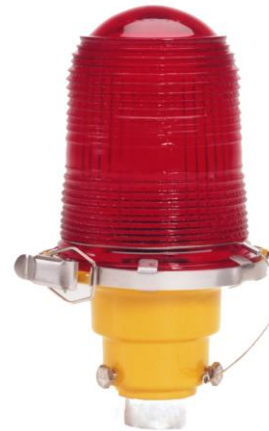
TABLE 3 OPTIONS