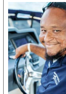
BEST WAY TO CRUISE Marine Max Vacations was recently named the best BVI yacht charter company in the 2015 Virgin Islands Property and Yacht Reader's Choice Awards. Simplicity is a big reason. The Marine Max team provides ground transportation from the airport to the dock. There, a technician briefs you on the systems the islands. With its 23'6" beam, the 484 Power Cat has four double cabins, each with private head and shower. See more at marinemaxvacations.com