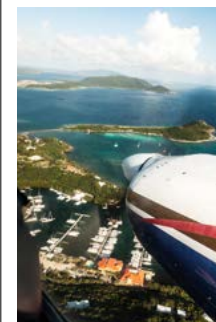
BEST WAY TO ARRIVE Flying into San Juan, Puerto Rico, on a major airline carrier is an easy first step. From there, the most comfortable way into Tortola is with a private charter airplane company like Air America Inc. (airamericacaribbean.com). It's a 45-minute flight with spectacular views islands and fleeting glimpses of the Marine Max base at Hodges Creek.