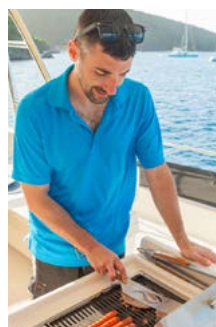
PORTABLE PARTY Smells from the BBQ sent a message through the boat and to the stand-up paddleboarder that a meal was ready.