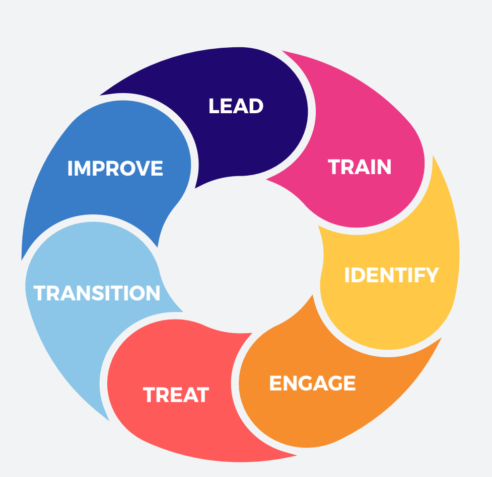
Adapted from: Zero Suicide Institute at Education Development Center

As maternal suicide has only begun to garner much-needed attention the last few years, research specific to maternal suicide prevention strategies has been scarce. Since the Zero