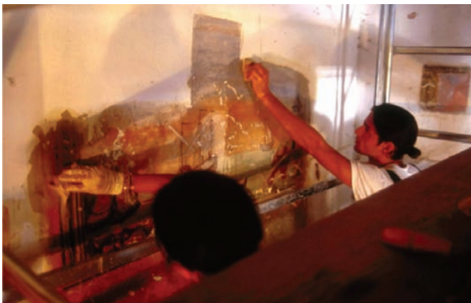
Figure 1. A traditional approach to art diagnosis and restoration. In this example, a sample region was scraped to determine what lay beneath the wall paint (see the patch on the right side of the image). At one depth, the diagnosticians found a fresco, and the restorers chose to uncover the entire wall to that layer.

Alternatively, medical imaging equipment can be used to produce high-resolution images of the artwork at different wavelengths (e.g. infrared, ultraviolet, x-ray). These represent various materials deposited over the course of the painting's history, from original sketches to layers of pigment and varnish. While safe, multi-spectral scans require specialized training to analyze, and the work is almost entirely carried out on single-user graphics workstations. When analyzing a multi-spectral scan, the diagnostician begins by precisely aligning the co-located high-resolution images with a multi-layered photo editing software on a powerful computer. Then, she looks for anomalies between the layers by zooming into a detail and superimposing two scans in transparency. By gradually adjusting the opacity of one image relative to another, the diagnostician can more easily perceive differences between the scans. These are usually analogous to alterations made over the history of the artwork. The diagnostician then saves the image detail, together with