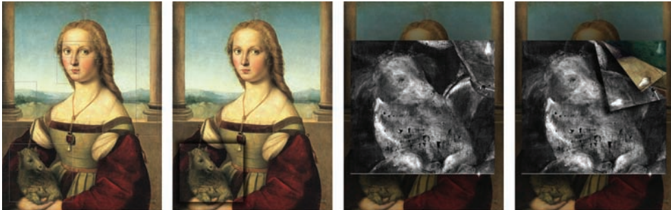
Figure 9. Our professional art diagnostic interface design. From left to right: faint outlines highlight areas of interest; selecting an area causes it to pop out of the background; the area expands to fill the screen and begins to fade between the uppermost layers; users can select which layers to fade between by turning over an image edge and selecting from the page corners (the page corner interaction is derived from the Fold n' Drop technique, see Dragicvic, 2004).

the same token, areas of interest on the touch screen are uploaded to the on-line repository, informing curators which parts are of most interest to visitors.