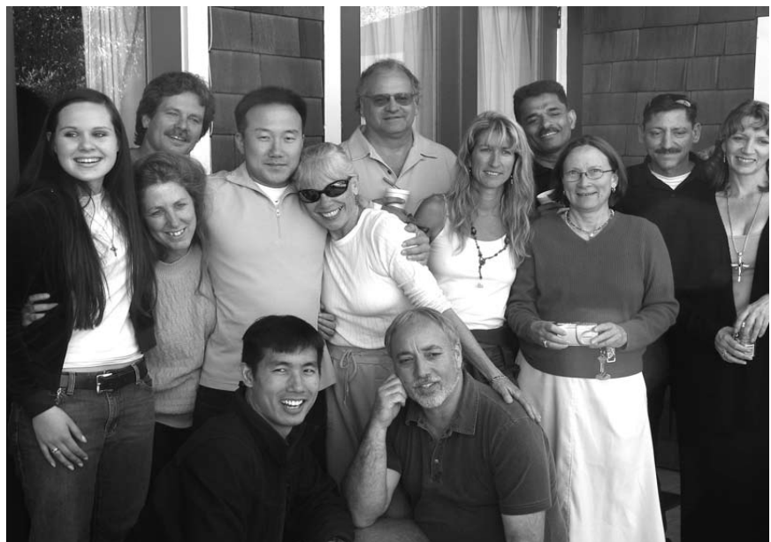
A few of our students from an Accelerated Level 4 joined in this spontaneous photo during a class break. Students pictured here came to this class from various states from Hawaii to Delaware, and from Singapore and Canada.