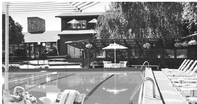
Our classes have been established for 30 years at the lovely Corte Madera Inn, a 5 acre resort-like setting with plenty of free parking.

We strive to be very accessible . Email welcome@hypnotherapy.com for further information or call us at 800-256-6448 (toll-free within the U.S., Canada and Caribbean countries) or +1-707-579-9023 internationally. In addition, there is plenty of time for questions and answers at our free introductory meetings.