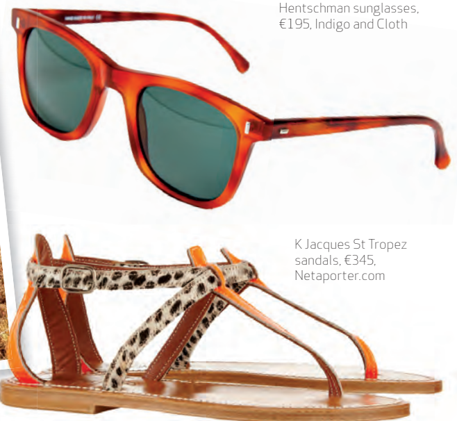
Hentschman sunglasses, €195, Indigo and Cloth