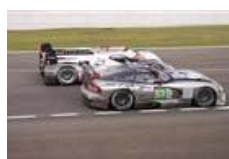
Le Mans unlike anything else on Earth