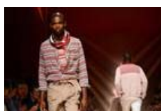
Gallery: Missoni -- Milan Collections Menswear Spring 2014