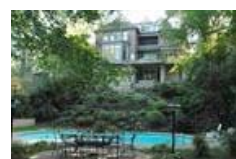
Gallery: Bright, spacious Forest Hill home, Toronto -- $6.95M