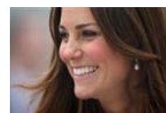
Kate's royal baby: an early labour?