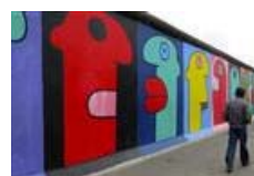
East Side Gallery longest remaining stretch of Berlin Wall