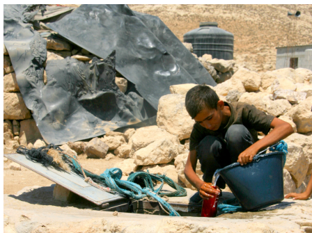
Drawing water from a cistern in the village of Khirbet Jenbah, Photo by Sharon Azran, B’Tselem

Palestinians have less water than needed for basic survival: 50,000 Palestinians in 151 communities live on less than the minimum amount of water deemed necessary by the World Health Organization (WHO) for “short-term survival.” Mekorot routinely cuts Palestinian supply – sometimes by as much as 50 per cent – during summer months to meet consumption needs in Israel and the settlements. As of September 2011, some 313,000 Palestinians across 113 West Bank communities were not connected to a water network. Israel’s 2014 war on Gaza left over 100,000 people with no connection to water networks; the electricity shortage results in 40 percent of the Gaza population only getting water supply for 5-8 hours once every three days.