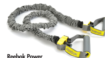
Reebok Power Tubes Set , £26, from reebok.co.uk

Finding it hard to get motivated? The right kit can make all the difference. From winning workout gear to fit tech, these are some of our favourite exercise partners