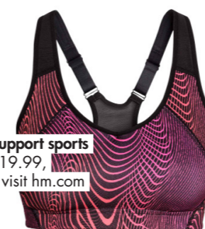
High support sports bra , £19.99, H&M; visit hm.com

Combining a wrist-based heart monitor and a training guide, this clever bit of tech can keep track of your progress 24/7, is waterproof and