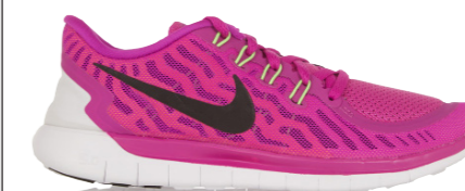
Nike Free 5.0 Mesh Sneakers , £100, from net-a-porter.com

Many of us have unused exercise bands lurking in a drawer. But here the addition of two easy grip handles means you can do 120