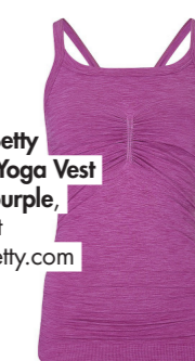
Sweaty Betty Niyama Yoga Vest in Neonpurple , £50, visit sweatybetty.com

The special double layer construction prevents rubbing, while antibacterial silver fibres keep foot odour at bay xxxxxxxxxx xxxxxxxxxx