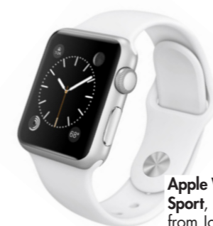
Apple Watch Sport , £299, from John Lewis

With these wireless ear bud earplugs you can move freely as you work out to the soundtrack of your choice – and they come in a carry case