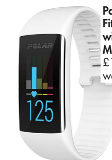
Polar A360 Fitness Tracker with Heart Rate Monitor , £154.50, from watchshop.com

A super-light design with six different flex points; cushions your feet as your run and walk xxxxxx xxxxx xxxxxxxxxx