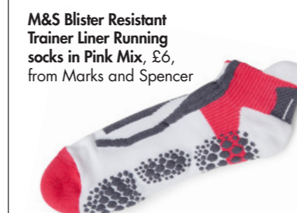
M&S Blister Resistant Trainer Liner Running socks in Pink Mix , £6, from Marks and Spencer

Measures the way you move throughout the day – from walking the dog to climbing stairs, as well as any gym or mobile workouts. Use to