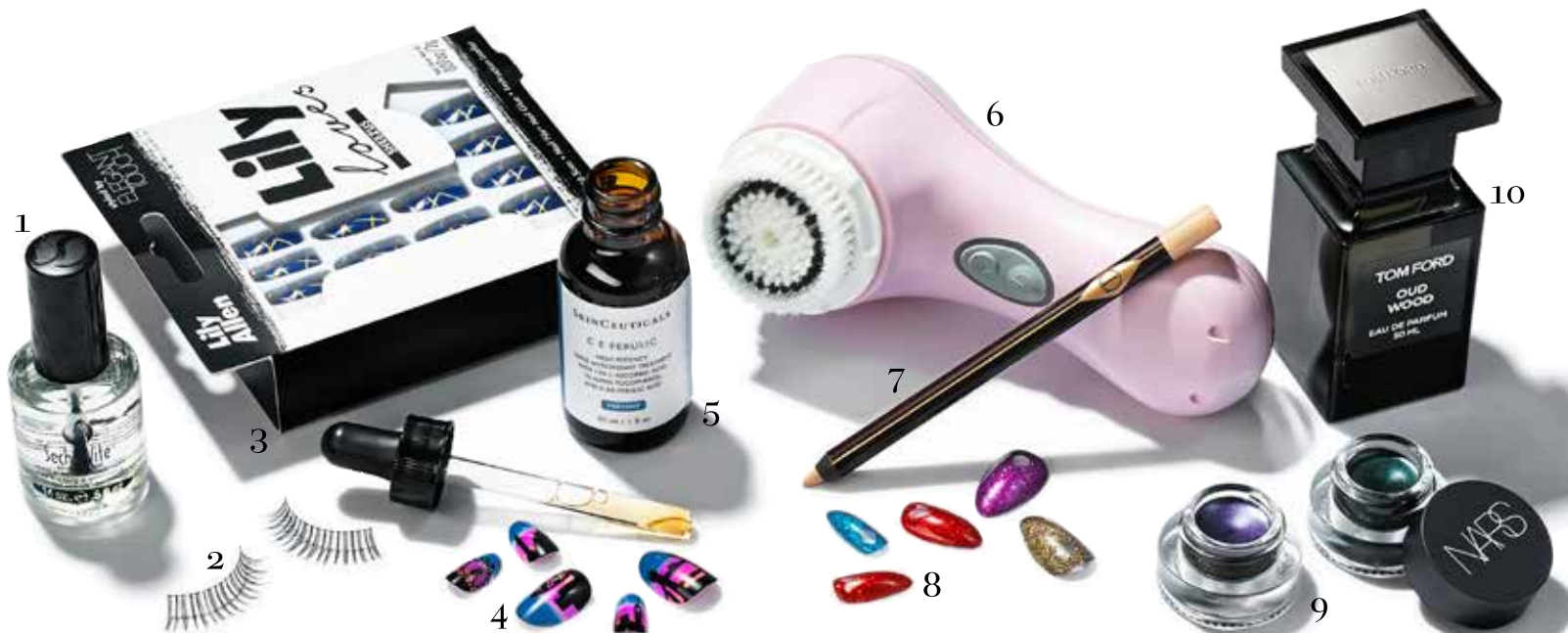
LILY LOVES... 1. Seche Vite Dry Fast Top Coat, £9 2. Eylure False Lashes 116, £5.06 3. Elegant Touch Lily Loves in Sheezus, £8.99 4. Elegant Touch Lily Loves in LDN, £6.99 5. SkinCeuticals C E Ferulic, £128 6. Clarisonic Mia 2, from £125 7. Charlotte Tilbury Rock 'n' Kohl Eye Cheat, £19 8. Elegant Touch Lily Loves in Littlest Things, £7.99 9. NARS Eye Paint in Snake Eyes and Tatar, £18.50 each 10. Tom Ford Oud Wood, from £142