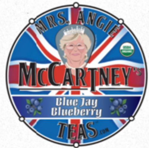
Blue Jay Blueberry