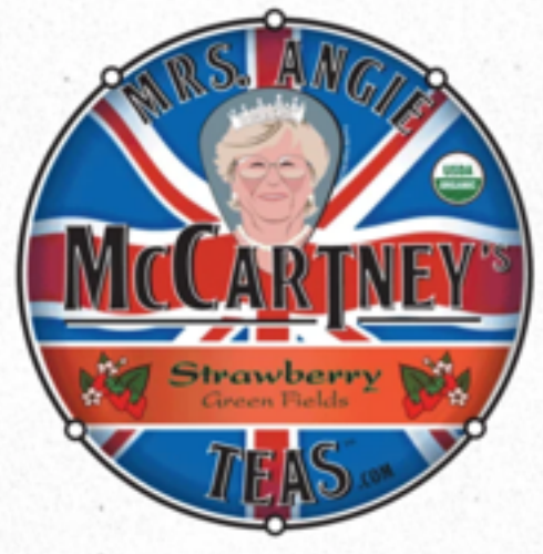
Strawberry Green Fields