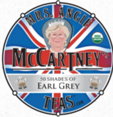
50 Shades of Earl Grey