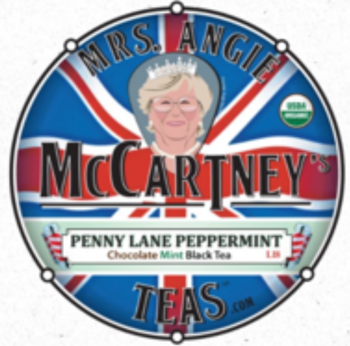
Penny Lane Peppermint