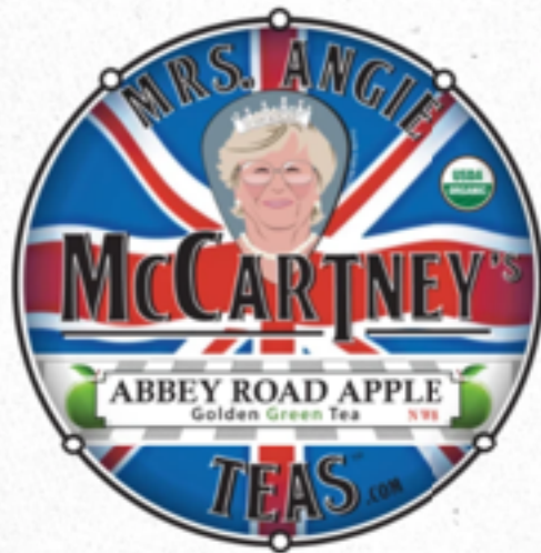
Abbey Road Apple