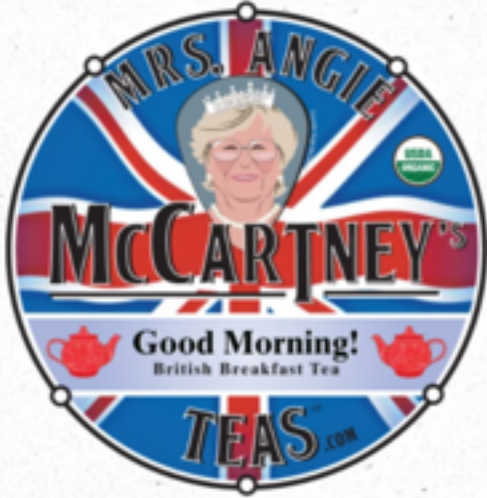
Good Morning ! British Breakfast

...with more Fab Flavors on the website MrsMcCartneysTeas.com