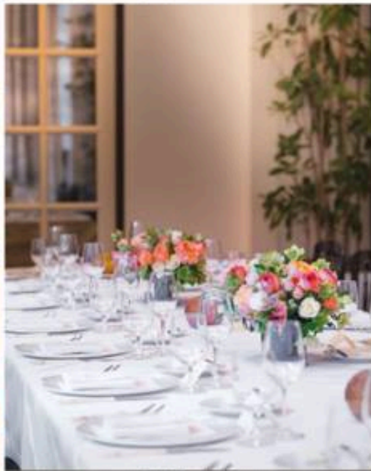
Spago Beverly Hills