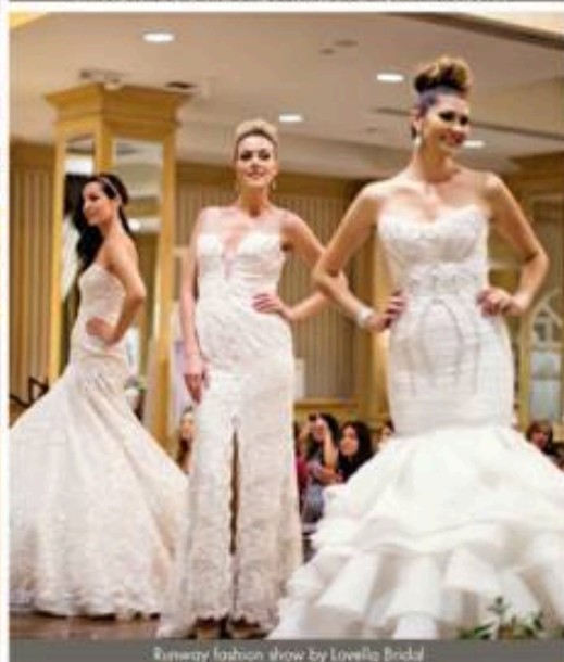
Runway fashion show by Lovella Bridal