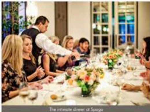
The intimate dinner at Spago