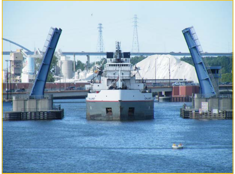
Manitowoc traveling through the Main St. Bridge

The Greater Green Bay Convention & Visitors Bureau will host the First Ship Arrival contest once again. The person who comes closest to the date and time of the first ship's arrival will win a prize package offered by the Port of Green Bay. To enter your official guess of date and time, there will be a link coming in mid-February on the Port of Green Bay website at www.portofgreenbay.com and Greater Green Bay Convention and Visitors Bureau website at www.greenbay.com .