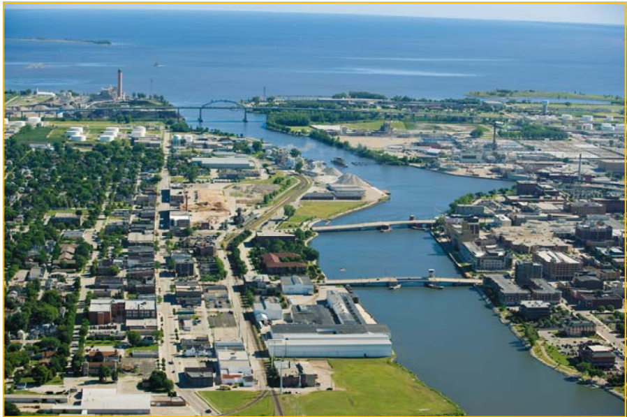
Aerial view of the Port of Green Bay in 2013

(Green Bay, WI) - The 2015 shipping season opened on April 3 rd , 2015 with the Michigan Great Lakes arriving at U.S. Venture to export petroleum products. After thoughts of turning around because of ice conditions the Transport finally made it to Fox River Dock carrying salt on January 15 th , 2016. The last time a ship came in as late as January 15 th was in 2006 when the Algoway arrived at Fox River Dock on January 15 th , 2006, part of the 2005 shipping season. The latest a ship has arrived, in recent history, was part of the 2004 shipping season on January 21 st , 2005 when the Phillip R. Clarke arrived at Fox River Dock.