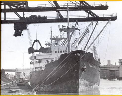
The Gloxinia in the Port of Green Bay before 1977.