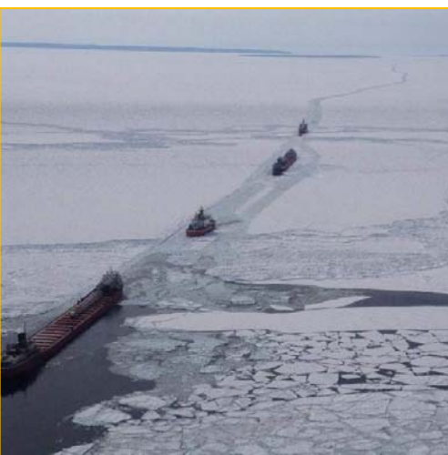
Lake Superior ice conditions in 2014.