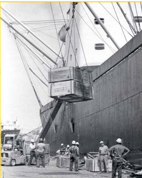
Unloading cargo in the Port of Green Bay around 60 years ago.