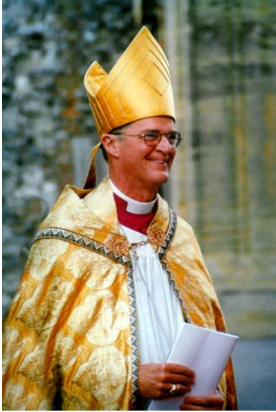
The Right Reverend Frank T. Griswold XXV Presiding Bishop of the Episcopal Church.

Frank Griswold was ordained deacon in 1962 and priest in 1963 after being educated at Harvard College, the General Theological Seminary and Oriel College, Oxford. He served three parishes in the Diocese of Pennsylvania before being ordained bishop coadjutor of the Diocese of Chicago in March 1987, where he served as bishop from 1987 until becoming presiding bishop and primate of the Episcopal Church in 1998. Since his retirement in 2006, he has continued a ministry in the Episcopal Church and in the wider fellowship of the Anglican Communion. Bishop Griswold has a particular interest in worship. As a priest he was a member of the Standing Liturgical Commission that prepared the present Prayer Book and as a bishop he served as chair of the commission from 1992 until 1997.