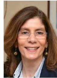
Prof. Pinelopi Koujianou Goldberg (Advisory Board Member)

Research focus: Applied microeconomic theory, empirical microeconomics, public economics, insurance market