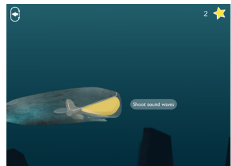
Learn how echolocation works