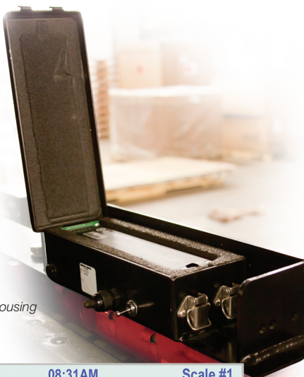
Wireless battery housing

The wired or wireless scale-to-indicator systems are available with either the CLS-920i or the CLS-420.