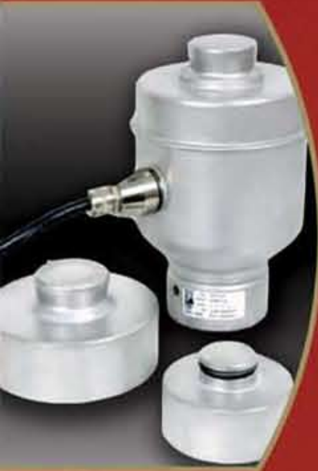
• CPR-M Analog Load Cell

Durability. B-TEK's Centurion-AT uses thicker, heavier deck plate that will resist wear and last longer. A simple design concept often missing from other suppliers' truck scales. A truck scales' decking is a wear surface, the more trucks per day, the greater the surface erosion. B-TEK's Centurion-AT weighbridge is built standard with 3/8" decking that is 50% thicker and 45% heavier per sq/ft than other suppliers' 1/4" weighbridge decking.