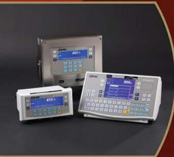
• Dialogk Digital Weight Indicators

Strength. B-TEK's Centurion-AT uses wider, thicker, and heavier I-BEAMS for superior weighbridge strength. Rust and corrosion are usually the root cause of structural failure in truck scale weighbridges with thin I-BEAMS. Doesn't it make sense to choose a truck scale with heavy I-BEAMS?