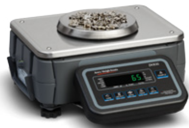
10 lb (5 kg) and 2 lb (1 kg) Models 6 in (150 mm) round platter