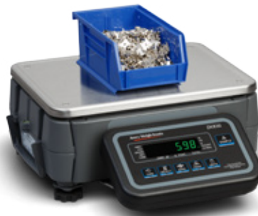
75 lb (35 kg) Model 9 in x 12 in (230 mm x 305 mm) platter