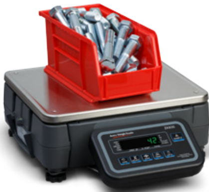
175 lb (80 kg) Model 12 in x 14 in (305 mm x 355 mm) platter

The ZK830 is available with a wide range of capacities from 1 lb up to 175 lb (500g to 80kg) - meeting most application requirements. A high precision scale offering 100,000 divisions (non legal-for-trade) or 10,000 divisions NTEP, OIML and Measurement Canada legal for trade is available.